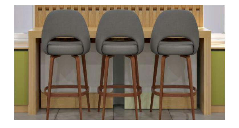
Bar counter made out of 20mm thk ply boxing finished with laminate - 1880mm x 500mm x 900mm - 75mm thickness