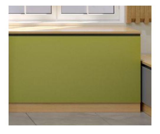
Storage Box of Top openable for storing foldable chair made out of 20mm thk ply finished with laminate and matching edge band – 1200mm x 450 x 750mm Total Nos –2